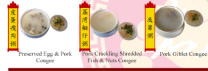
Preserved Egg & Pork Congee Pork Cracking Shredded Fish & Nuts Congee Pork Gilet Congee