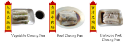
Vegetable Cheung Fun Beef Cheung Fun Barbecue Pork Cheung Fun