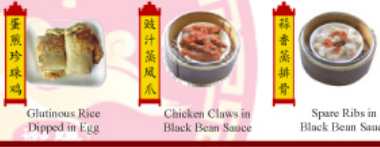
Glutinous Rice Dipped in Egg Chicken Claws in Black Bean Sauce Spare Ribs in Black Bean Sauce