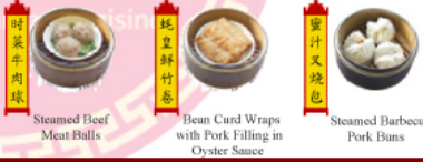
Steamed Beef Meat Balls Bean Card Wraps with Pork Filling in Oyster Sauce Steamed Barbecue Pork Buns