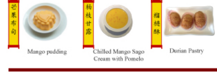
Mango pudding Chilled Mango Sago Cream with Pomelo Durian Pastry