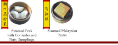
Steamed Pork with Coriander and Nuts Dumplings Steamed Malaysian Pastry