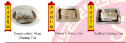
Combination Meat Cheung Fun Prawn Cheung Fun Scallop Cheung Fun