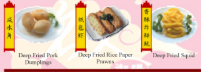
Deep Fried Pork Dumplings Deep Fried Rice Paper Prawns Deep Fried Squid