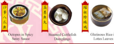
Octopus in Spicy Satay Sauce Steamed Cuttlefish Glutinous Rice in Lotus Leaves