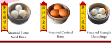
Steamed Lotus Seed Buns Steamed Custard Buns Steamed Shanghai Dumplings