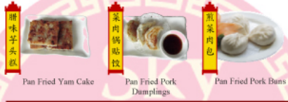
Pan Fried Yam Cake Pan Fried Pork Dumplings Pan Fried Pork Buns