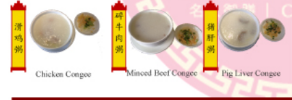
Chicken Congee Minced Beef Congee Pig Liver Congee