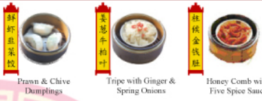
Prawn & Chive Dumplings Tripe with Ginger & Spring Onions Honey Comb with Five Spice Sauce