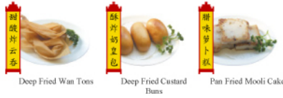
Deep Fried Wan Tons Deep Fried Custard Buns Pan Fried Mooli Cake