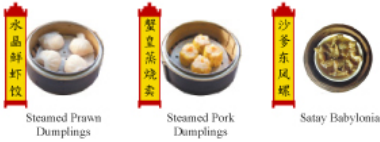
Steamed Prawn Dumplings Steamed Pork Dumplings Satay Babylonia