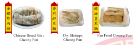
Chinese Bread Stick Cheung Fun Dry Shrimps Cheung Fun Pan Fried Cheung Fun