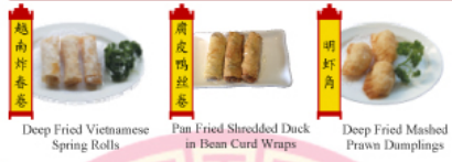
Deep Fried Vietnamese Spring Rolls Pan Fried Shredded Duck in Bean Card Wraps Deep Fried Mashed Prawn Dumplings