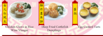
Chicken Claws in Rice Wine Vinegar Deep Fried Cuttlefish Dumplings Egg Custard Tarts