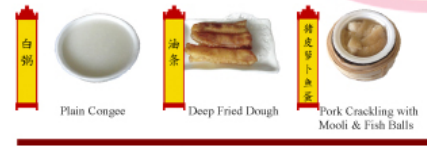
Plain Congee Deep Fried Dough Pork Cracking with Mooli & Fish Balls